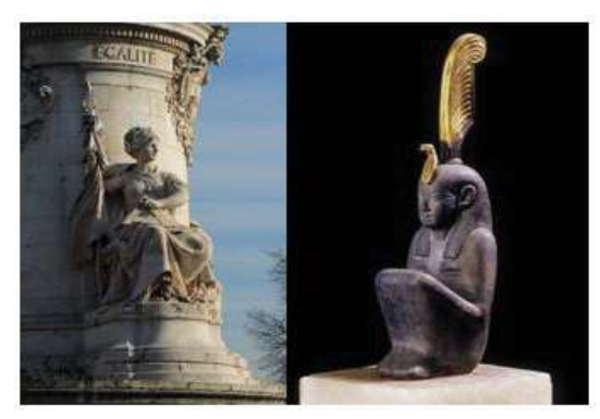
Figure 2: Left: the eurasian rhetorical ethic of égalité (hypocrisy, falsehood, and fraud) masquerading as Right: Maat (truth)

It is also at this juncture that we return to the irony of Ataa Armah's lament about those who "have spent their careers lying to African children about African history, philosophy, science, literature, and culture" (Armah, 2018, p.12). The reader is again left to wonder whether it is proper to expect a career novelist—a writer of fiction—to one day decide to weigh himself down with the encumbrances of historical accuracy, evidence, documentation, and truth when it is so much easier to write "theends-justify-the-means" fiction in the style of the victorious "Seth" of his own imagination. In his articulated view, he attributes Asth 'Seth's' supposed success as being due to the use of clever ruse. Therefore, to counter it, has he not brought forth his A Wat Nt Shemsw: The Way of Companions book as a counter-ruse in service of the eurasian deity égalité? As such, has not his perhaps genuine misapprehension of the facts of what the myths actually say led to a perverted solution in which the Asth 'Seth' of his imagination—born of Plutarch's paraphrases—has bequeathed him a method of deceit as the sure-fire way to victory and success?